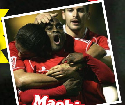
Machines 87th Minute Winner