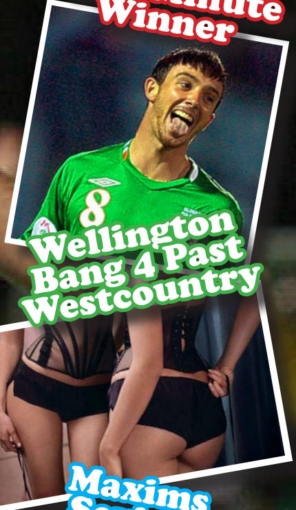
Wellington Bang 4 Past Westcountry